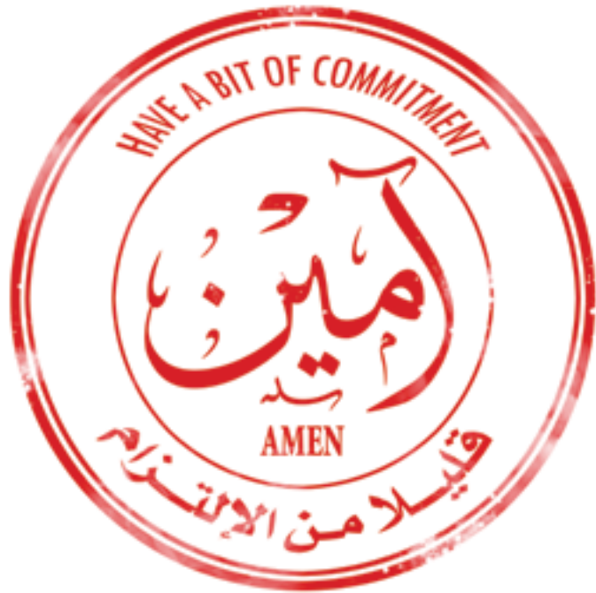
The Stamp – Amen, 2012

Silk-screen print with 4 colours and 2 glazes on 410 gsm Somerset Tub paper Edition of 25