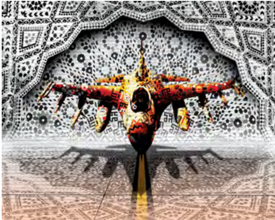
In Transit - Fighter, 2013

Rubber stamps, digital print and paint on 9 mm Indonesian Plywood board