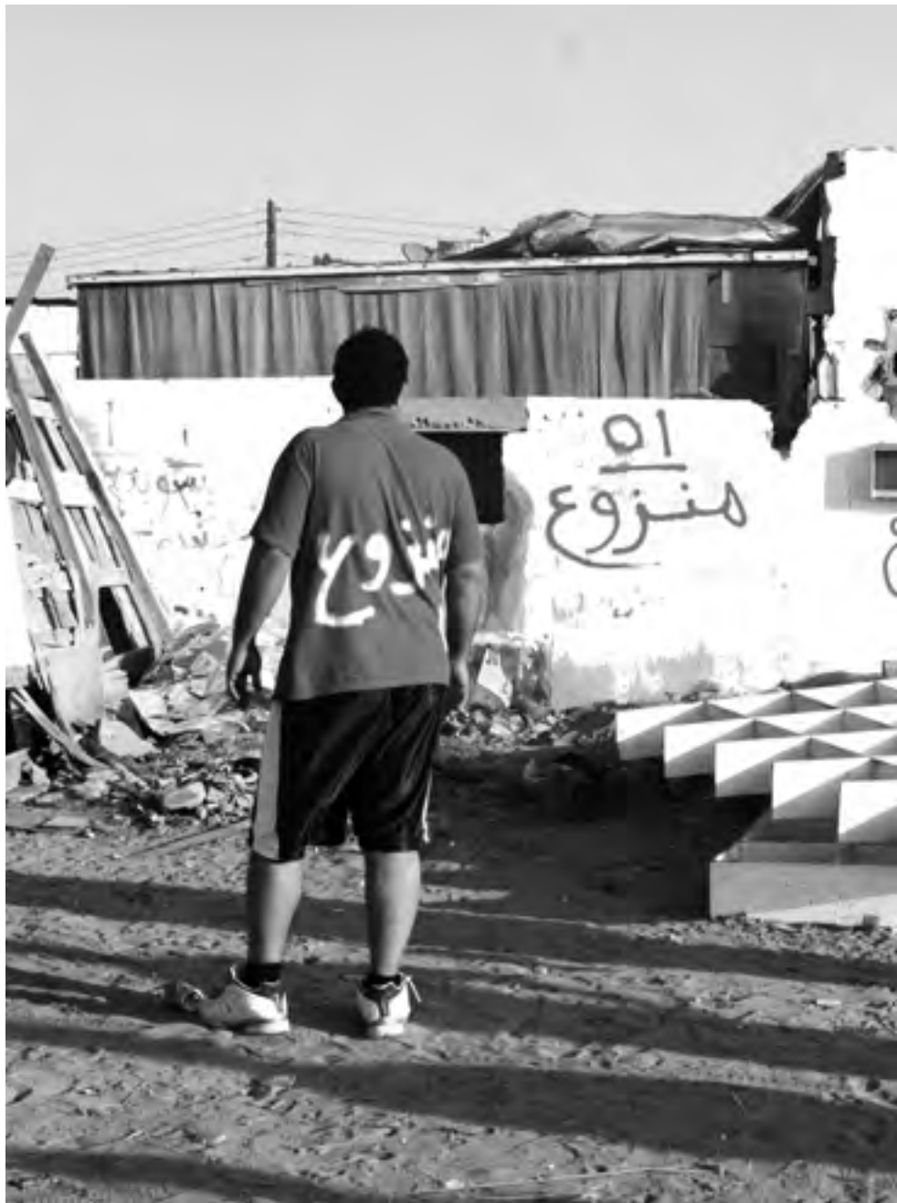
Detail from Manzoo , 2013