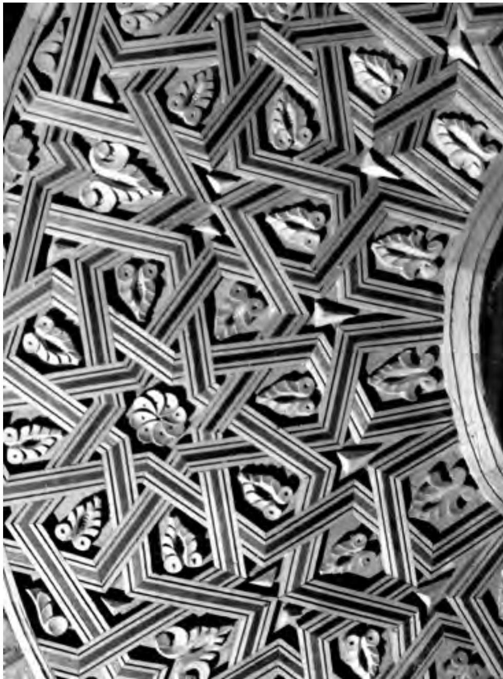
Detail from The Stamp – Moujaz , 2013