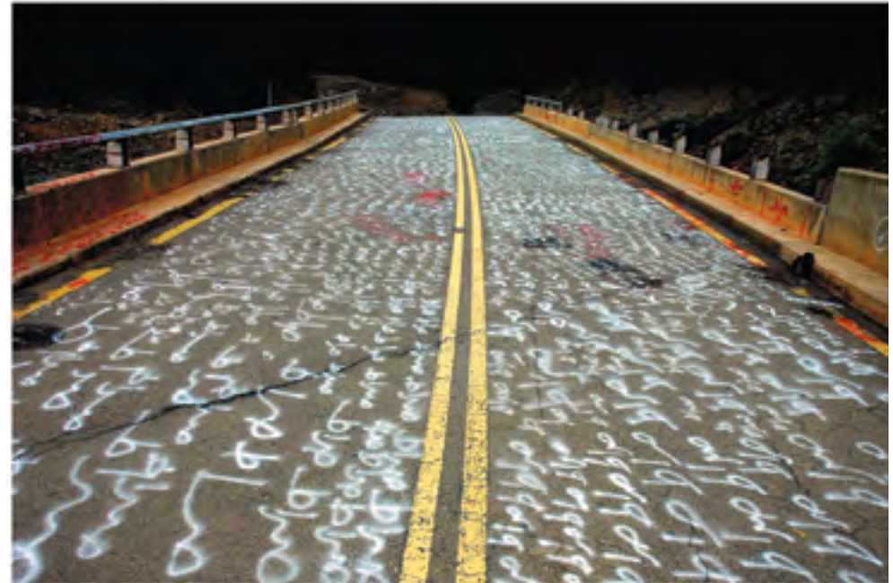
Siraat - The Path , 2012

Silk-screen print with white diamond dust printed in 15 colours and 2 glazes on 410 gsm Somerset Tub paper