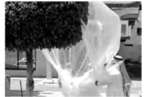
Flora & Fauna, 2013 12 Coriander Digital Prints with silk-screen glaze on Photorag paper presented in cloth covered solander box