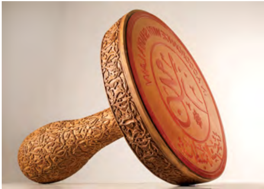
The Stamp – Moujaz, 2013

Hand Carved oversized wooden stamp with embossed rubber face. Handle 95 cm & stamp 95 cm circumference and 18 cm deep