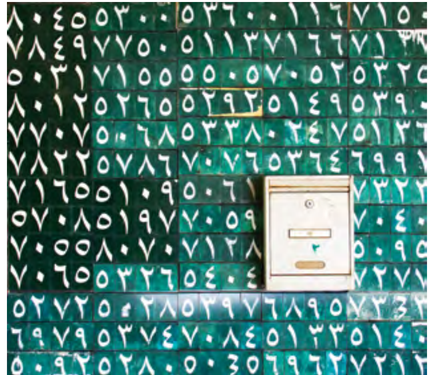
Manzoa – House Number II, 2013