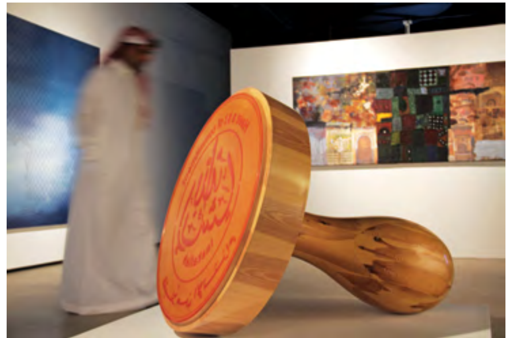
The Stamp – Inshallah, 2013 Oversized wooden stamp with embossed rubber face. Handle 95 cm & stamp 95 cm circumference and 18 cm deep