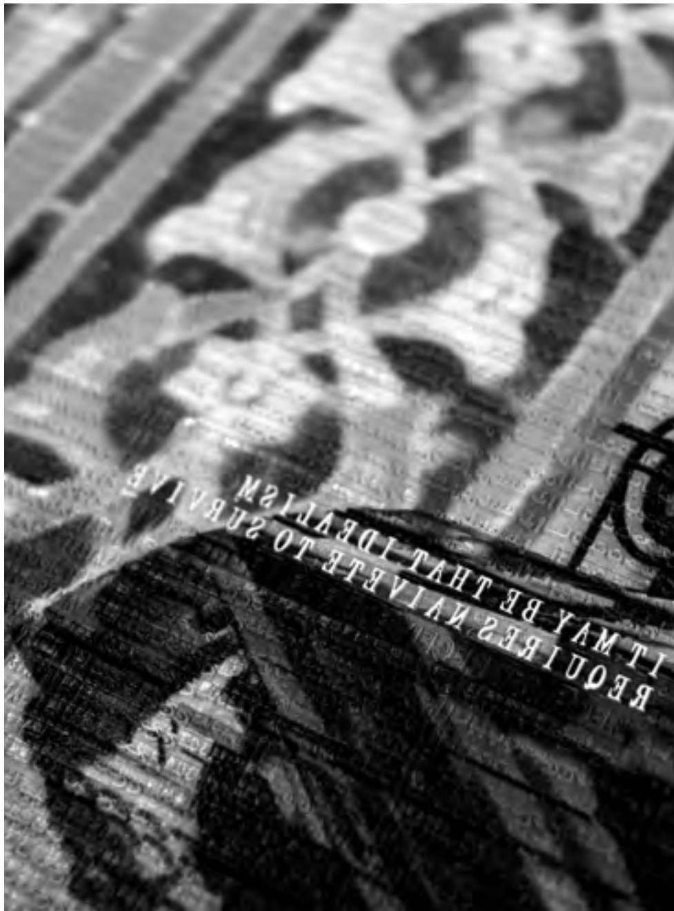
Detail from Camouflage , 2013