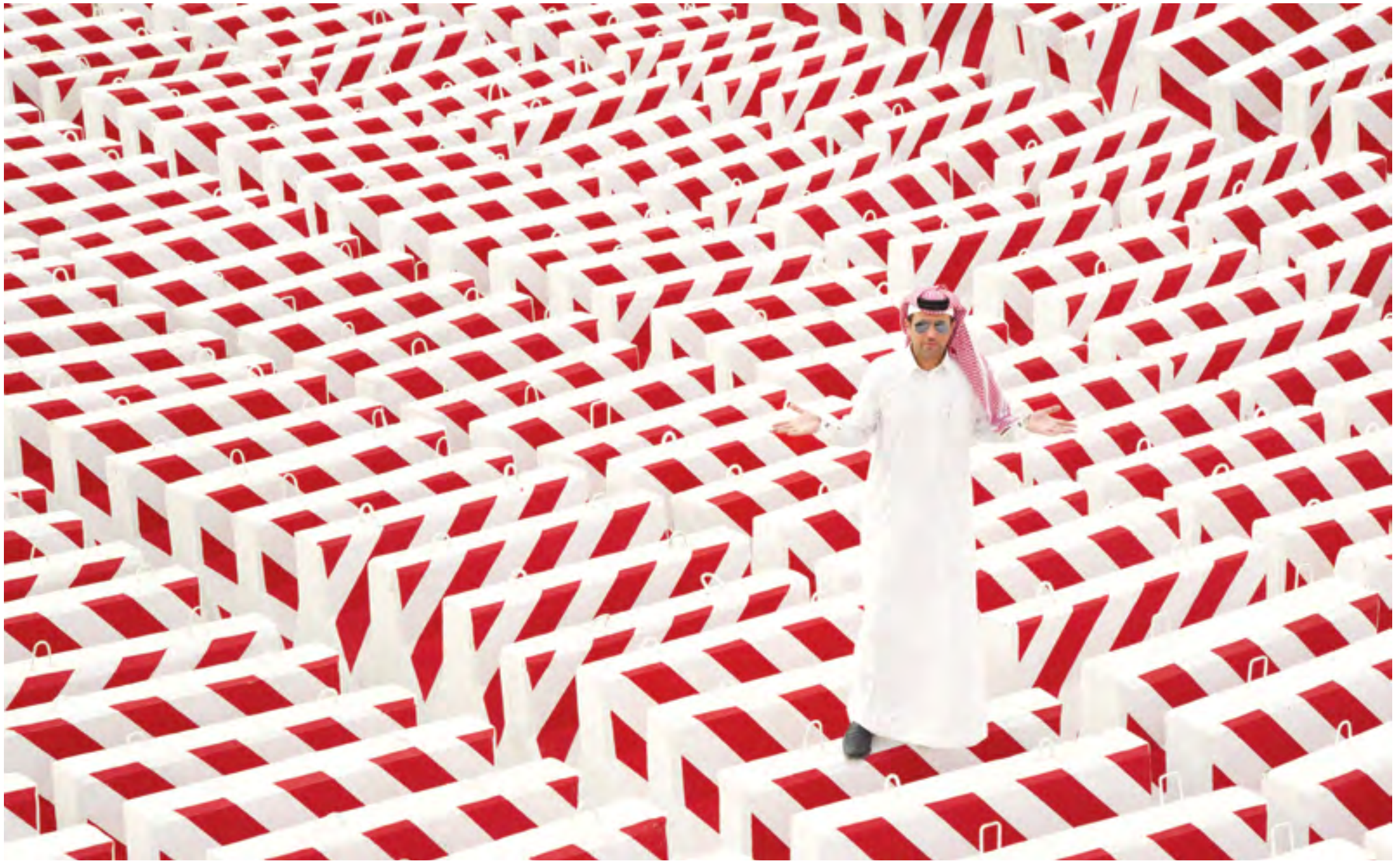
The artist in Riyadh, 2013