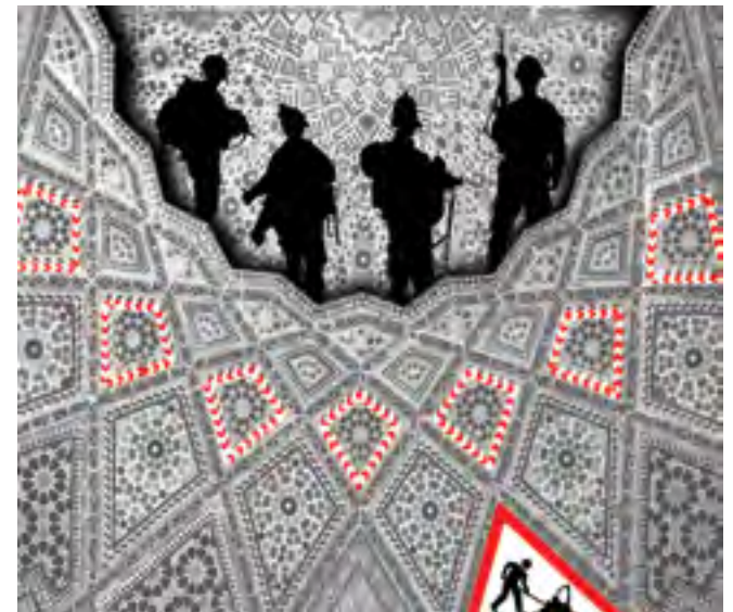
Men at Work I - IV, 2012

Silk-screen print with 11 colours and 2 glazes on 410 gsm Somerset Tub paper, soldier applied with diamond dust and collage