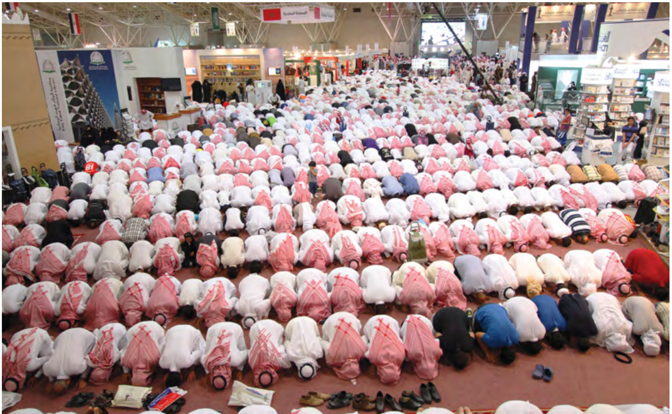
Still from Riyadh Book Fair, 2013