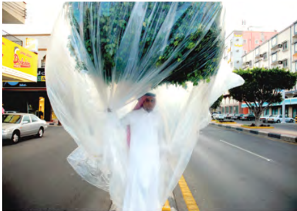
Flora & Fauna , 2013

Pigment print with silk-screen glaze on photorag paper