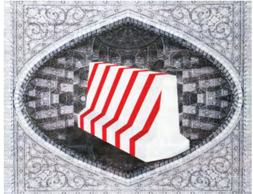
Concrete - Mocárabe, 2013

Rubber stamps, digital print and paint on 9 mm Indonesian Plywood board