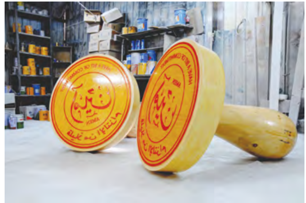
The Stamp – Amen, 2013

Silk-screen print with 4 colours and 2 glazes on 410 gsm Somerset Tub paper Edition of 25