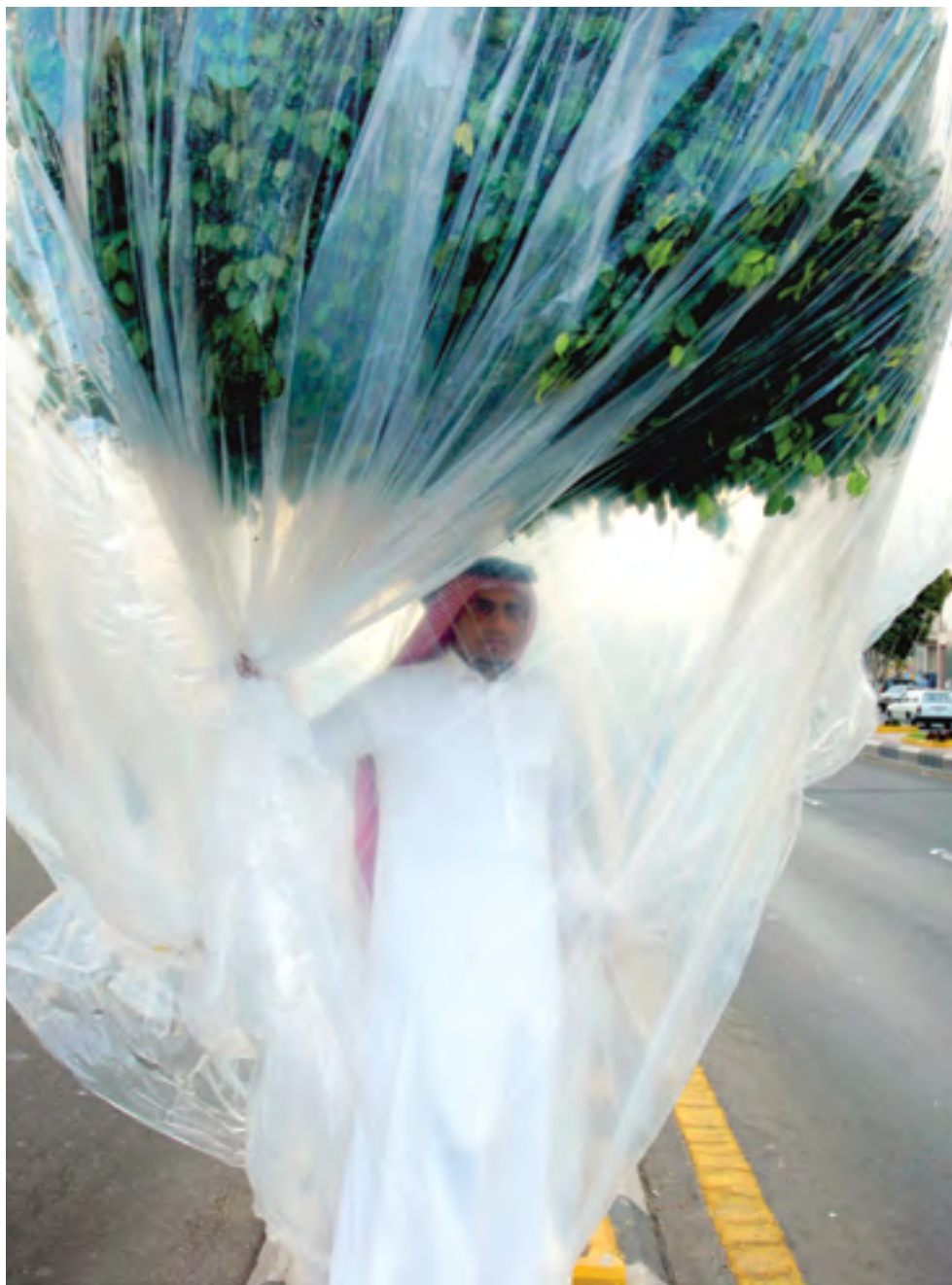
Detail from Flora and Fauna , 2013