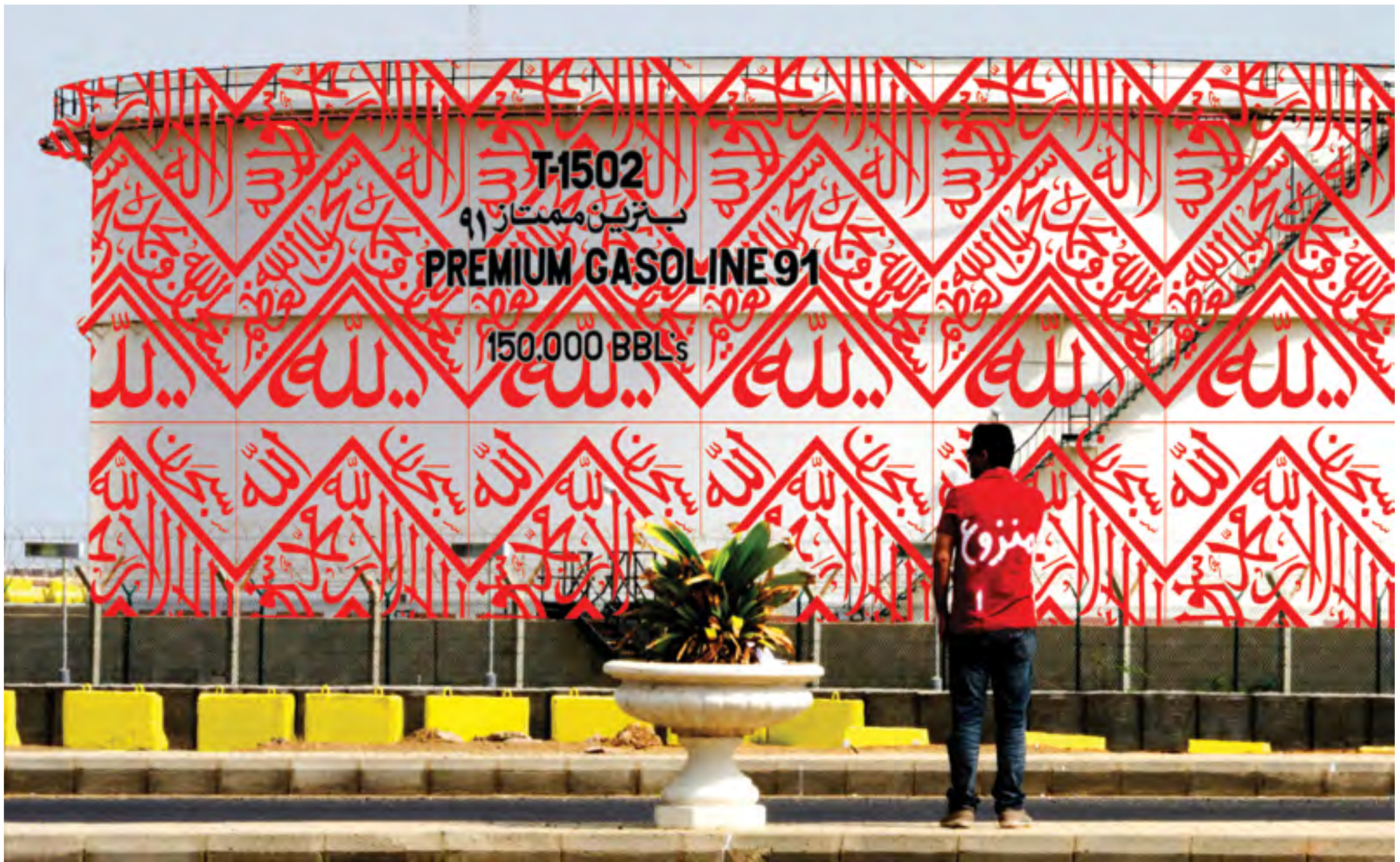
Detail from Manzoa, 2013