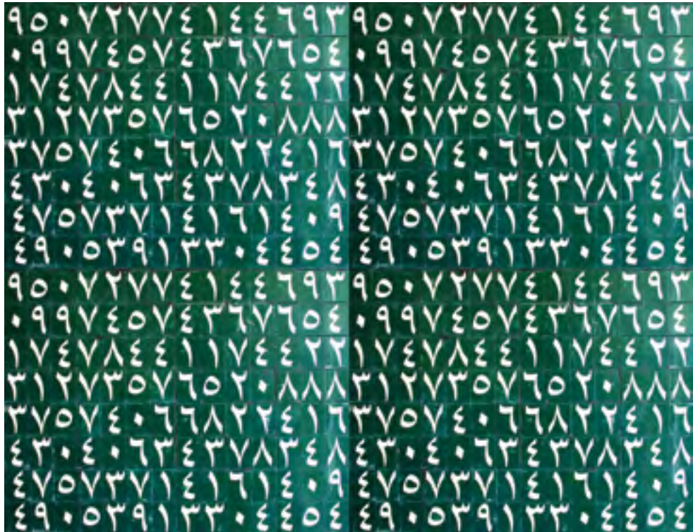
Manzoa – House Number I, 2013