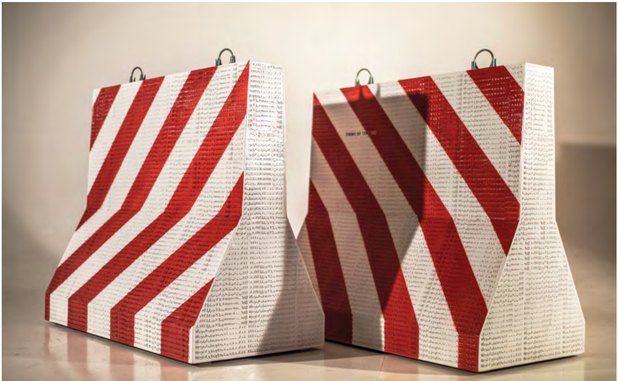
Concrete Block (Red & White), 2013

Rubber stamps, digital print and paint on 9 mm Indonesian Plywood board