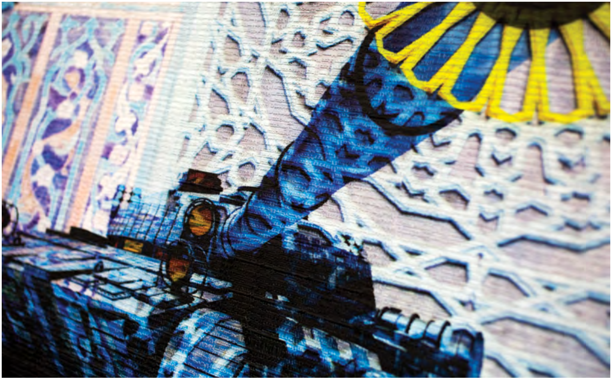
Detail from Camouflage , 2013