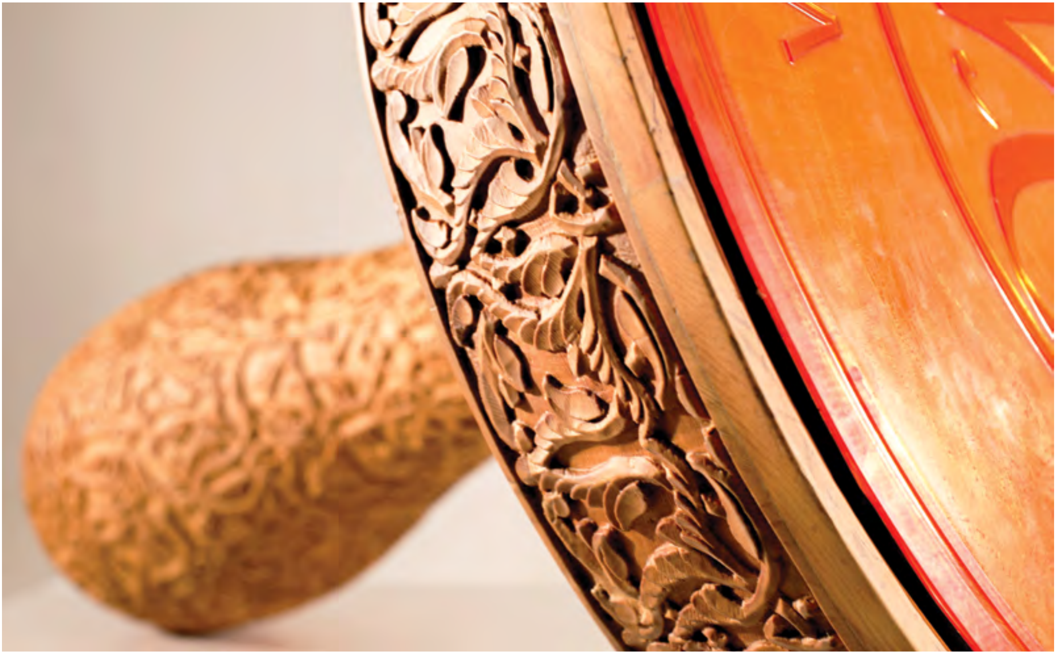
Detail from The Stamp – Moujaz, 2013