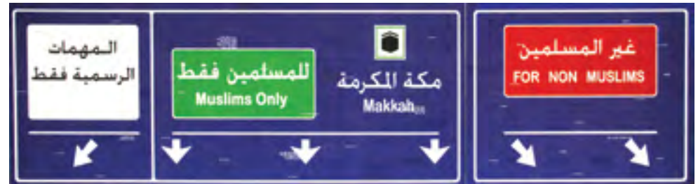
Road to Makkah V, 2013

Rubber stamps, digital print and paint on 9 mm Indonesian Plywood board