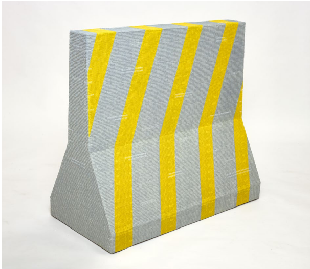
Concrete Block V, 2022 Rubber stamps and industrial lacquer paint on 9mm plywood board 40.5 x 43.3 x 21.25 in (103 x 110 x 54 cm)

His perspective as an artist is very much informed by his experience as a military officer in Saudi Arabia for most of his adult life. As a military man he says, “ I was instilled with repetition. Orders were issued to us and then we repetitively reissued them to others. I felt the harshness of repetition. ”