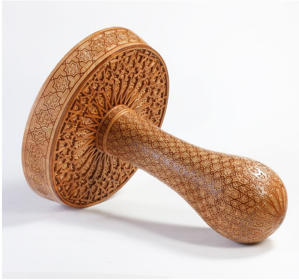
The Stamp (Moujaz), 2022 Hand carved wood with embossed rubber face 36 x 36 x 40 in (91.4 x 91.4 x 101.6 cm)

communication and discourse for all, though there are governments that would suppress such access in an attempt to limit information.