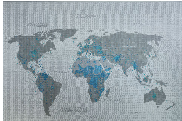
Climate Refugee, 2022 Lacquer paint on rubber stamps on aluminum 42.9 x 63 in (109 x 160 cm)

Gharem invites us to look more closely at the ideological and physical barriers we’ve created that separate people on this planet. By seeing and listening, we have the possibility of understanding that different ideas, cultures, and beliefs have currency.